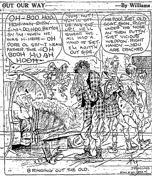
BRINGING OUT THE OLD.