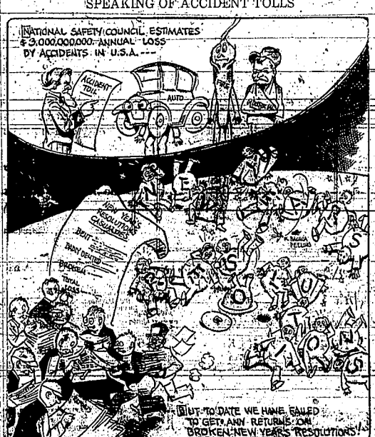
NATIONAL SAFETY COUNCIL ESTIMATES $3,000,000,000 ANNUAL LOSS BY ACCIDENTS IN U.S. - - - - - (Plane Turn to Page Three)

Premier Primo de Rivera of Spain Says Relations with United States are of Great Importance in World.