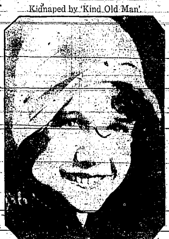
Kidnaped by 'Kind Old Man'.

DEFENSE WANTS STATE QUESTION MORE WITNESSES Victims of the murder trial in Pennsylvania are now being called to testify.