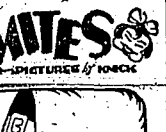
THEY COLOR THE PICTURE