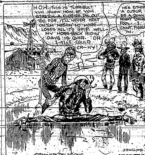
STRAINED RELATIONS. ILLUSTRATION BY J. WILLIAMS.