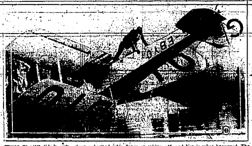
THIS PLANE didn't quite clear a barbed wire fence on takeoff, and here's what happened. The two engine plane got stuck with minor bruises by jumping into the fence, which landed upside down, was wrecked. The flier had set out from Whitechurch, England, to spend the holidays at North Devon and when they almost hit a church spire in a heavy foggy haze. It was when hoping of a second time that the accident pictured above befell them.