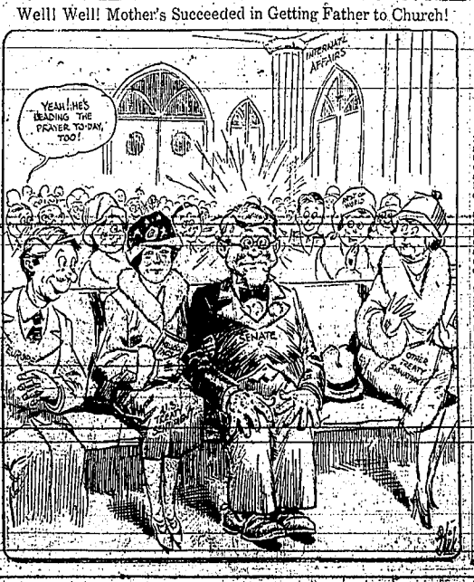
We'll Well! Mother's Succeeded in Getting Father to Church!

Two men were killed and one injured in a collision between a passenger train and a freight train today.