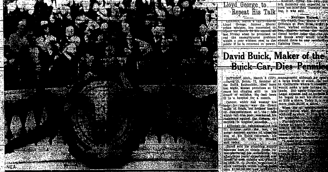
When Hoover took the oath of office as president of the United States, he was surrounded by a large crowd of people and officials.