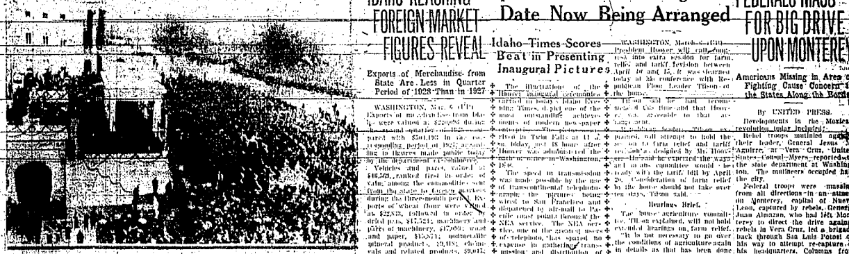
A photograph for N. E. A. Service and the Idaho Evening Times stood on the roof of the Capitol building where the picture of the inauguration services of Herbert Hoover. The picture was taken by telephone from Washington by Special Photographer for the Idaho Evening Times.