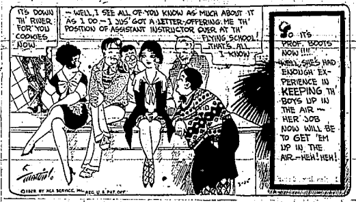
CHILD BY HER BOOTS, MARCH 25, 1929