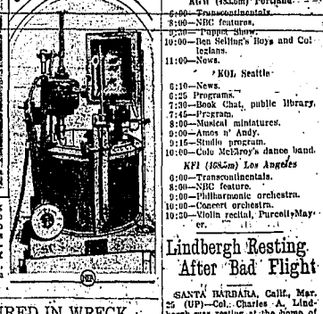
Roy Melvin, student at Iowa State College, Ames, Iowa, is working on a system to forecast the percentage of insects that will live through the winter and attack the following spring's crop. The size of an insect is placed in a compartment of the apparatus on right. The effect of different temperatures on the eggs is tabulated by checking with temperatures and insect scourges of that date. A prediction can be arrived at. This combinator, as shown at left, is used to calculate acreage error at the proper time to kill off harmful insects.