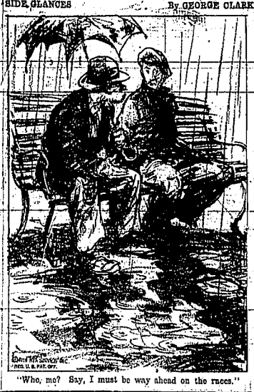
"Who, me? Say, I must be way ahead on the races."