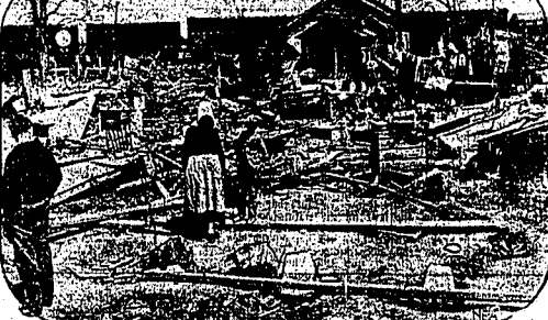
The tremendous task faced by relief agencies in the tornado area of Arkansas is indicated in the picture above, taken at Diaz. Many families lost everything in the storm. Others are, finding their belongings scattered at great distances from their homes.