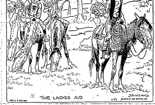
THE LADIES AID

OH MISTER STIFF, WHAT SHALL WE DO? I-I JUST CAN'T USE THIS WHIP! ON A P-HOOP NOR WICK-HIS STOMACH - IT'S CROO EL!