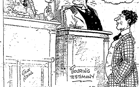
CHAP. 2844, W. 2000. 173 U. S. 810. 4-30

JMF—HM—M—HAR—RUMF— YES, YOUR HONOR.—I WAS LEADING UP TO THAT POINT—MY—AH—REASON FOR MENTIONING MY EXPERIENCES IN THE KIMBERLEY DIAMOND MINES, WAS MERELY TO PROVE THAT AN EYESIGHT KEEN ENOUGH TO FIND DIAMONDS IN THEM—SURELY COULD SEE THE BROAD DETAILS OF HOW AN ACCIDENT OCCURRED!