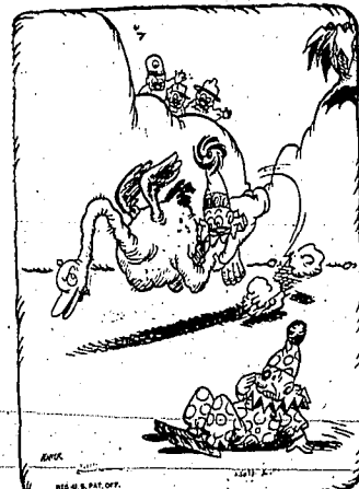
(READ THE STORY, THEN COLOR THE PICTURE)