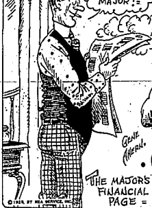
THE MAJORS FINANCIAL PAGE

THAT'S THE BEST LISTING IN TODAY'S STOCK MARKET. MAJOR!