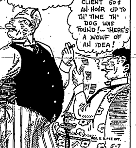
THE MAJORS FINANCIAL PAGE

NO KIDDING, - WHY DON'T YOU GO IN TH' LOST DOG BUSINESS, MAJOR? - YOU HAVE PLENTY OF TIME TH' PROFESSION WOULD REQUIRE! - THE HOOPLE LOST DOG FINDING CORPORATION - INSISTED OF A REWARD, - CHARGE TH' CLIENT $50 - AN HOUR UP TO TH' TIME TH' DOG WAS FOUND! - THERE'S A WOUND OF AN IDEA!