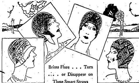
Brims Flare . . . Turn . . . or Disappear on These Smart Straws

That Wise Shoppers Expect Not Now and Then—But Every Day