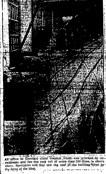
An office in Cleveland clinic hospital which was wrecked by an explosion and fire that took toll of more than 100 lives, is shown above. The cause was said to have been the roof of the building tilted by the force of the blast.