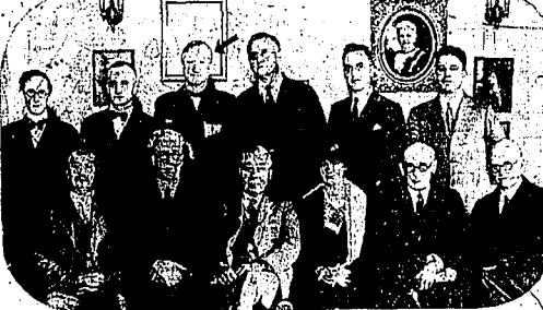
University of Des Moines trustees and faculty officials who met at Hartman to offer the present trustee board a new set of trustees.