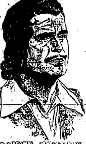
DOUGLAS FAIRBANKS Now in 'THE IRON MASK'

The latest picture which comes to the Idaho theatre tomorrow for a four day run. The added attraction "The Old Maid," a Paramount screen which every body enjoys in and out of the theatre hall.