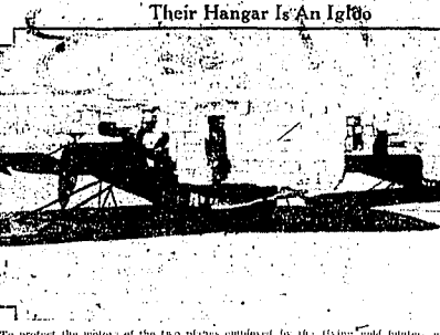
Their Hangar Is An Igloo

MOON'S PAINT STORE THERE'S A BETTER SHOW AT THE TODAY 100% TALKING LAST TIMES TONIGHT EXTRA! SPECIAL! EXTRA! Cleveland's Fire Horror Paramount and The Idaho Theatre 4 DAYS - STARTS TOMORROW!