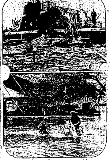
Missouri and Kansas have been hard hit by tornadoes and heavy rains which caused rivers to rise out of their banks, causing thousands of dollars in damage. The picture above illustrates the severity of the storm at Holbrook, Mo. The extent of the damage suffered a broken back. Inflow, flood in the Kaw Valley near Moberly, Mo., is shown. The two boys on horseback have just carried fire on the river on the elevation in the background.