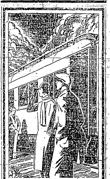
The trip itself is worth months of travel