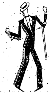
The very personable and entertaining M. C. was welcomed by a roof-raising ovation and, when the afternoon reception concluded, he delivered his routine of lively numbers. His debut was unquestionably a smash hit. Every number was received with fervent hand-clapping.