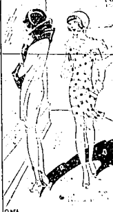
With skirts so short, it looks as if children are going to come in a few days.