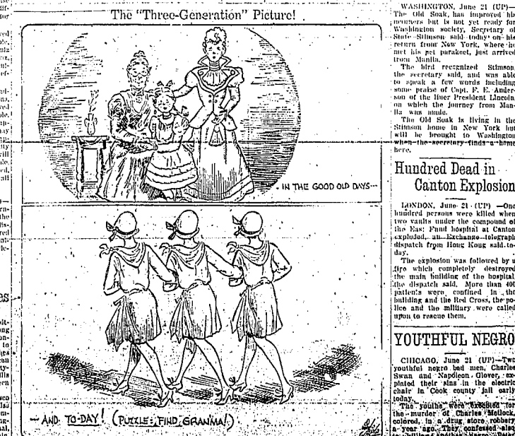
—AND TO-DAY! (PUZZLE, FIND GRAMMA)