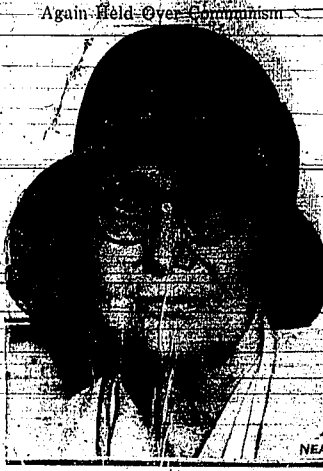
Anita Whitney, who was saved from a 11-year prison sentence by the pardon of Gov. Young, again is admitted to the California anti-communist movement.

Again Held Over Communist. Anita Whitney, who was saved from a 11-year prison sentence by the pardon of Gov. Young, again is admitted to the California anti-communist movement.