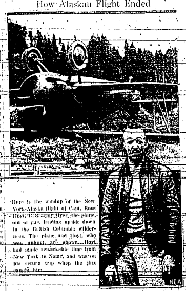
How Alaskan Flight Ended