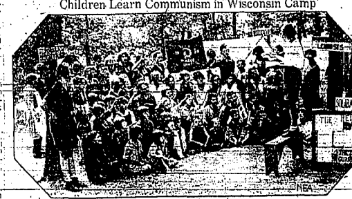
Children Learn Communism in Wisconsin Camp

PHOENIX, Idaho, August 6 (Special)—Possible wrecking of a passenger train No. 19 was averted Sunday afternoon when a tourist railroad man flung the train as it approached a section of track damaged by the overflow of a canal which broke through the embankment. The train was almost wrecked. The overflow of a canal which broke through the embankment.