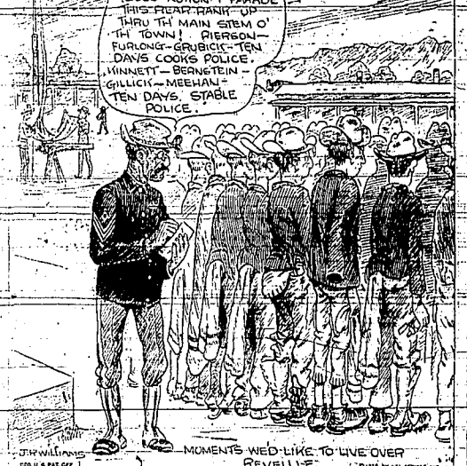
MOMENTS WED LIKE TO LIVE OVER REVELLE