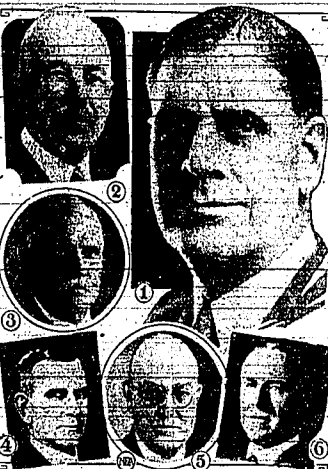
Leading figure at the conference of the western division of the United States Chamber of Commerce was shown here, and in Governor George W. Dyer of Utah.

The state later yesterday posted a reward of $1,000 for the capture and conviction of the murderer and residents of Glens Ferry, King Hill and vicinity were at once notified.