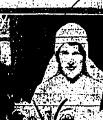
First Photo of Coolidge Wedding