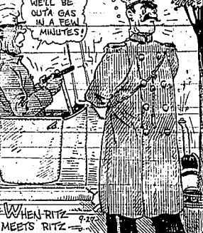
WHEN RITZ MEETS RITZ

THAT MRSIMP CAN SIT IN HIS FOOTPAAL FOR A WEEK BEFORE I OPEN THE DOOR AGAIN FOR HIM. FIVE TIMES TODAY ALREADY! WHOIDER WHAT HIS SWINDLE IS? I'M AFRAID HE'LL LIGHT UP A TORCH AN' START SELLING 'INDIAN SAVIE' FOR MAJ-OR BEAS! WHILE HIS SHILL-IN-FRONT PLANS 'H' BAJJO.