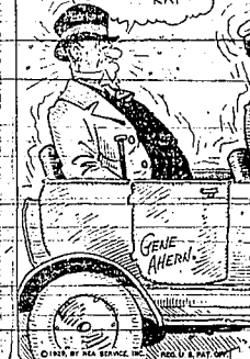
WHEN RITZ MEETS RITZ