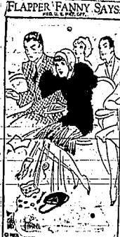
FLAPPER FANNY SAYSE Some girls who drop into a hole with alcohol, candy, pure and whatnot, keep right on going.