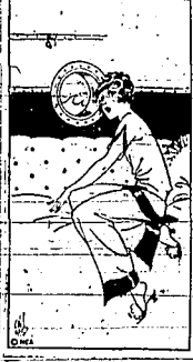
For social folk, starchy crosses are mostly bunk.