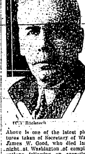
Above is one of the latest pictures taken of Secretary of War William Good, who died last night at Washington of complications following an operation for appendicitis.

Death Comes Peacefully After Cabinet Member Had Lingered For Hours In Comatose Condition