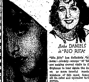
Bebe DANIELS in "RIO RITA"

"The picture of the century... wonder of the world!"