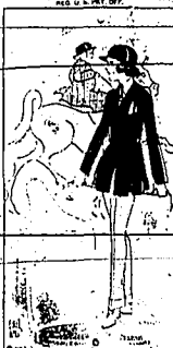
Fat women will use my slender excuse to get that way.