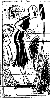
With people who are trying to reduce, a waist is a loss.