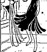
Shaw people prefer Sims from an opera artist, rather than an actress.