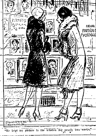
"He kept his picture in the window for nearly two weeks."