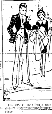
Flapper Fanny says that the girl who after having sex with a boy is not like the girl who never had sex. She says that the girl who has had sex is not like the girl who never had sex.