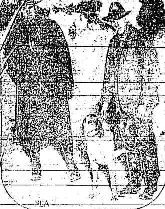
"Old Barney" in Lion Hunt