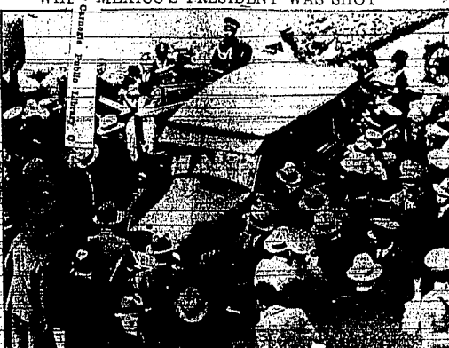
This picture shows the crowd about the official car of President Pascual Ortiz Rubio at the hospital in Mexico City where he was taken after he had been shot by a would-be assassin last night. He was taken to the hospital after being shot by a would-be assassin last night. He was taken to the hospital after being shot by a would-be assassin last night.