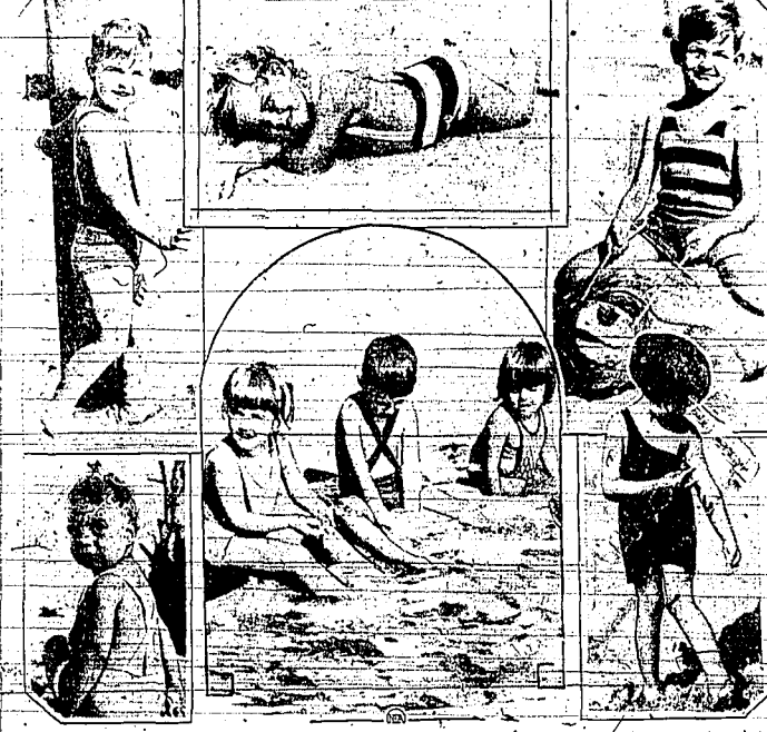
Just "Sunny" on the beach. The "Sunny Boys" and "Sunny Girls" are playing on the Florida sands. The children are enjoying the sun and sand, building sandcastles and playing with toys.