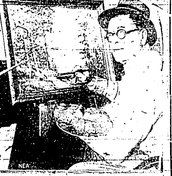
Glenn Scobey Warner, Pop Warner, has been named state director of the Idaho State Board of Education.