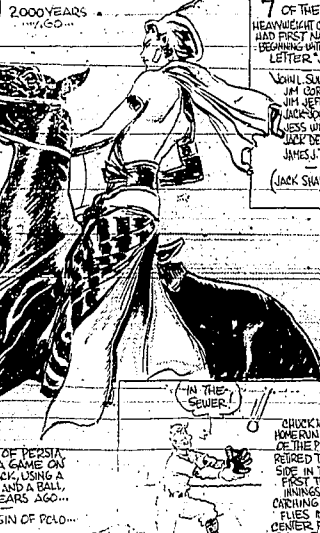
WOMEN OF PEORIA PLAYED A GAME ON HORSEBACK, USING A Mallet and a Ball, 2000 YEARS AGO. THE ORIGIN OF PELO.

7 OF THE 9 HEAVYWEIGHT CHAMPIONS AND FIGHTING MEN BEGINS WITH THE LETTER 'J'. JOHN SULLIVAN, JIM CORBETT, JACK DONOHUE, JACK DEMPSEY, JAMES J. TORNEY, JACK SHARKEY.