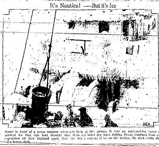
Stand in front of a warm radiator when you look at this picture. It was an unheated-for-cargo of national for this hot radiator last night after day when Idaho flows returned from a station in New England coast. Note the ice coating of ice on the boiler, the red robin and a house.