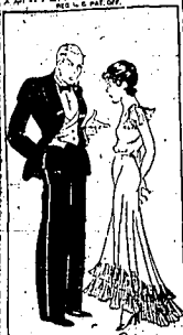
The same old thing some people never give away is a lot of their mind.