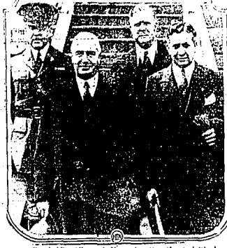
Governor Frank G. Allen of Massachusetts (front left) heads this delegation which called on President Hoover in Washington to invite the Chief Executive to attend the American Legion convention in Boston, October 5 to 8...