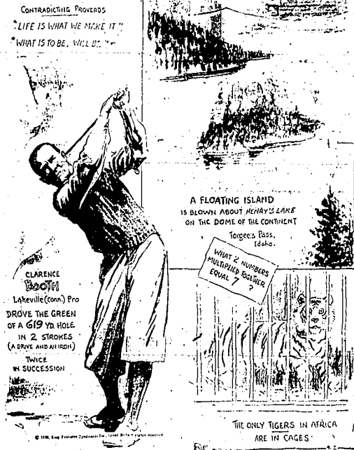
THE ONLY TIGERS IN AFRICA ARE IN CAGES.

Explanation of This Cartoon Will Appear in Tomorrow's Times. (Fig. in U. S. Post Office)