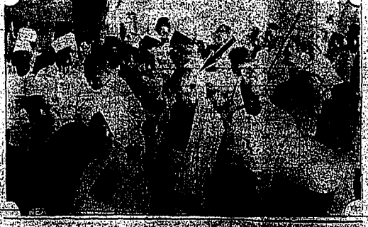
Through a very long and arduous march, Mrs. Henry Ford is advocating more highway fruit and vegetable stands...