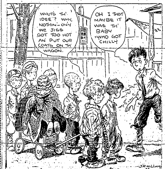
HERDES ARE MADE—NOT BORN.