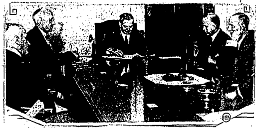
The two great continents of the Western Hemisphere were linked by telephone for the first time during this historic occasion...