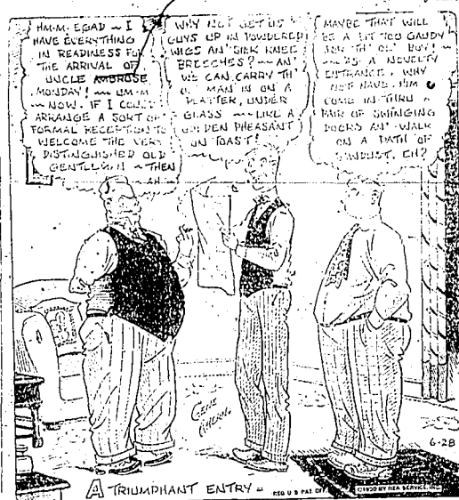
A TRIUMPHANT ENTRY