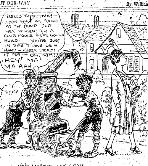
WHY MOTHERS GET GRAY THE HIGH NAT.

BERLIN, (UP)—More disabled war veterans are drawing compensation... The number of disabled war veterans receiving compensation today than at any time since the end of the World War.