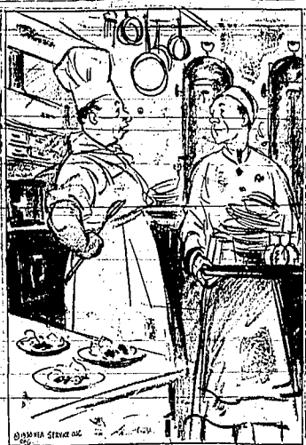
That you think he should have shot that first policeman that came after him?

Al Simmons' Ball. With trembling fingers we open the dazed mail. For a little while we look at the picture of Al Simmons, the world's greatest ball player, and the late citizens are after him.