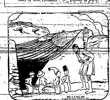
READ THE STORY, THEN TOLD THE PICTURE: