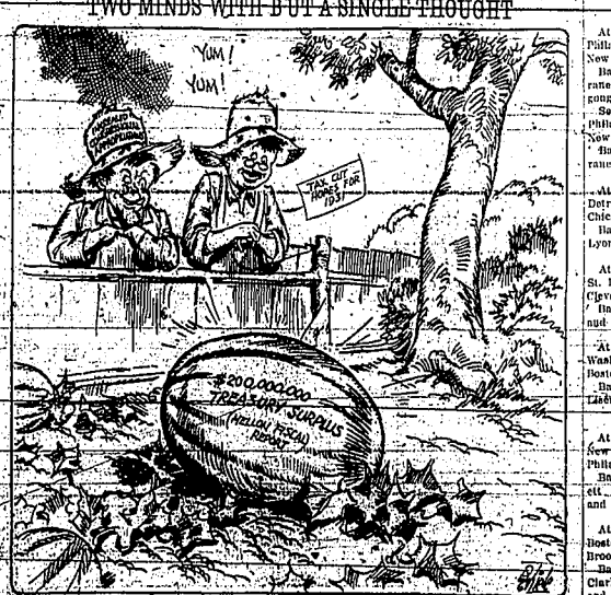
Two minds with but a single thought.

The hunters, who have been successful in their hunt for the elusive "wild turkey," are being praised by the citizens of their home town.