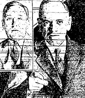
Portrait of a man, likely related to the steel merger case.