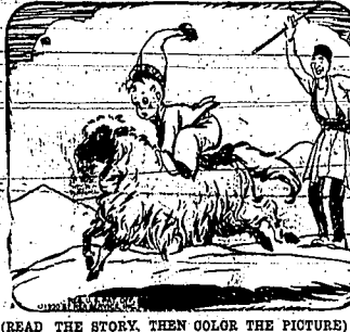
(READ THE STORY, THEN COLOR THE PICTURE)

As Cloway tasted of the soup, he little place he had in mind. They walked right in and down to bed. A flick of sleep, not far away, they jumped up feeling good and dressed up quickly as they could. And then they went out for a walk where new places could be found. "Oh, look!" cried Cloway. "What I see is quite a pretty sight to the others looked and saw a flock of sheep, not far away, they jumped up feeling good and dressed up quickly as they could. And then they went out for a walk where new places could be found. "Oh, look!" cried Cloway. "What I see is quite a pretty sight to the others looked and saw a flock of sheep, not far away, they jumped up feeling good and dressed up quickly as they could. And then they went out for a walk where new places could be found.