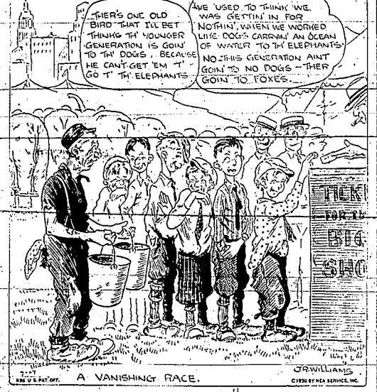
A VANISHING RACE.