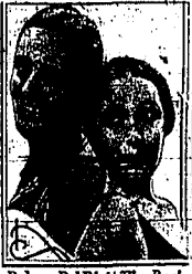
Dolores Del Rio, 'The Bad One' from 'The Bad One'.

At the Theatres AT THE IDAHO "Laramie" and "Secret of the Sahara" are together only once in motion picture, although not in their original characters.