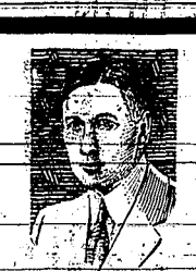
Portrait of a man, likely related to the Sage Hen Season article.

Sage Hen Season Starts August 10 The sage hen season in Twin Falls county will open August 10, and close August 25, unless the question of the sage hen season regular rulling is set aside by the Idaho game department before then.