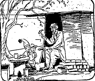
(READ THE STORY, THEN COLOR THE PICTURE)

They watched the potter on his high as you are and then were covered about. 'Saw! He surely carried his money; why that trunk was so full of gold!