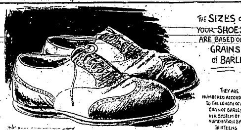
THE SIZES OF YOUR SHOES ARE BASED ON GRAINS OF BARLEY