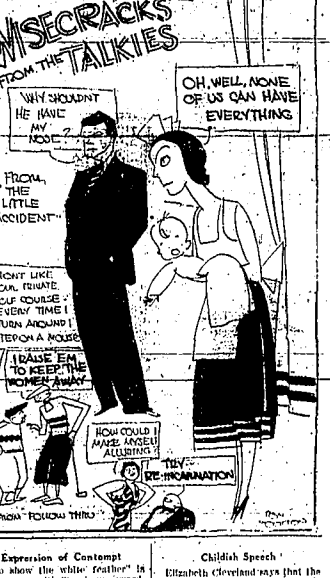
WISCRACKS FROM THE TALKIES. OH, WELL, NONE OF US CAN HAVE EVERYTHING. FROM THE LITTLE ACCIDENT.