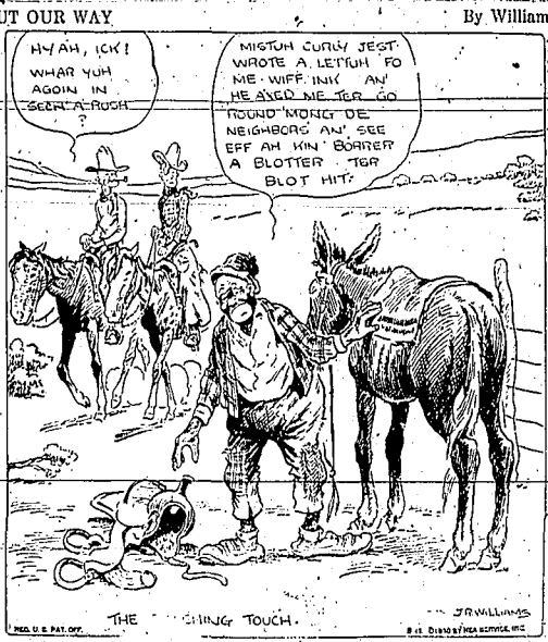
THE SHING TOUCH.