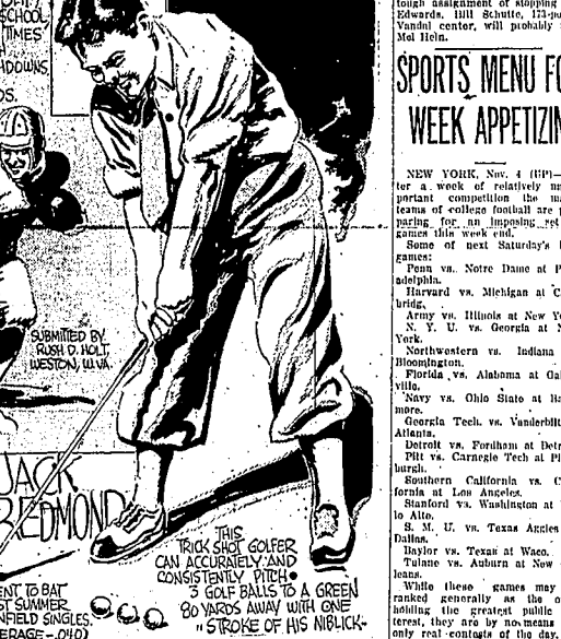
TRICK SHOT GOLFER CAN ACCURATELY AND CONSISTENTLY PITCH 5 GOLF BALLS TO A GREEN 30 YARDS AWAY WITH ONE STRIKE OF HIS CLUB.