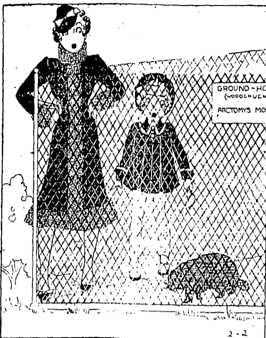
"And I have to keep on wearing my old winter coat six weeks more because this variant is scared of the dog."