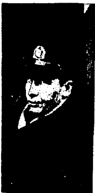
Capt. Ernst Lehmann, veteran commander of the Hindenburg and aboard in an advisory capacity on her fatal trip, was among those killed in the great disaster.