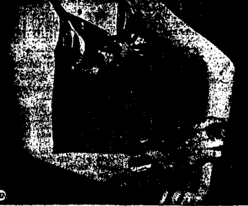
Sybil's lip curled imperceptibly, he could have done much better.

THE GENTLEMAN IN THE THIRD ROW. THE tiny Green Hills bungalow of John Ware Hendry bore little testimony to the fact that its owner was one of the foremost of our outstanding specialists in mining securities.