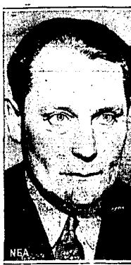
Col. Gen. Hermann Goering, one of the leaders of the Nazi government, today ordered speed in the building of another huge German ship to take the place of the burned Hindenburg.