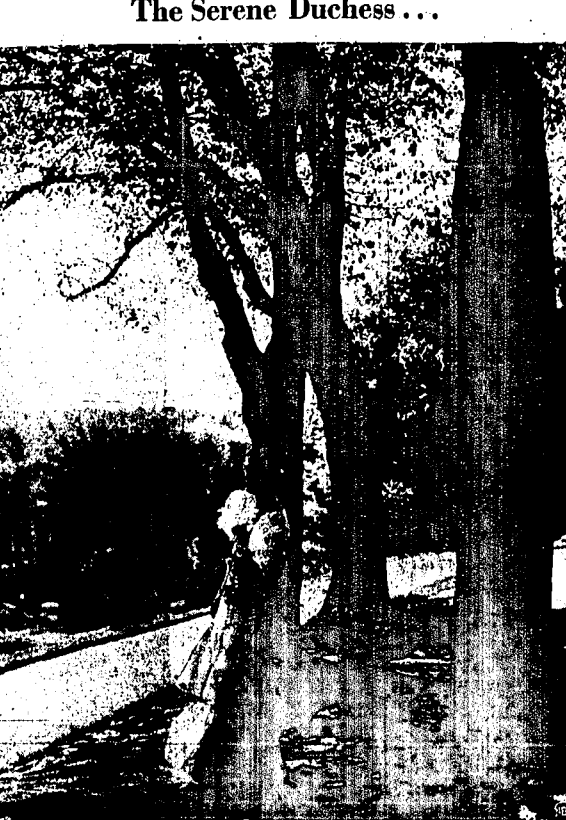
The Duchess of Windsor poses for Vogue, the fashion magazine. This picture, taken at the Chateau de Candé, is from a photo of photographs appearing in the June 1 issue. It clearly reflects the serenity of the former Wallis Warfield, American divorcee who cost the Duke of Windsor his crown...