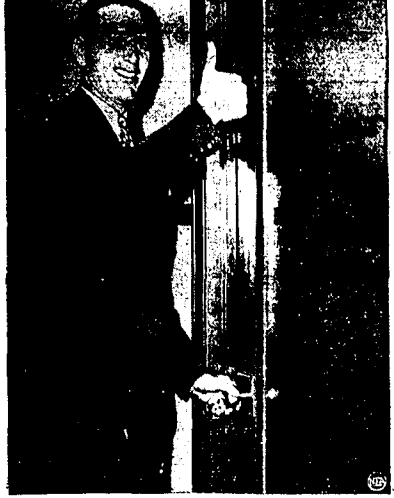
Dizzy Dean, St. Louis Cardinal's talkative pitching ace, has been reinstated by President Ford Frick of the National League. Here the star hurler is seen emerging from Frick's office, a white smile on his face, for although he was reinstated, he failed to sign any papers, which is just what he would not do.