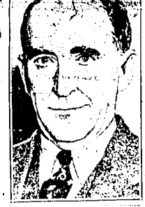
Speaker of the House William B. Bankhead, today met with President Roosevelt and aided in the mapping of a seven-point legislative program.