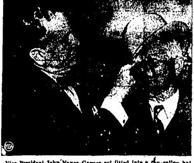
Vice President John Nance Garner got fitted into a ten-gallon hat by Senator Tom Connally in a ceremony during the annual press vs. Congress baseball game at Quantico, Va. The hat was the gift of the National Press club of Washington, D. C.