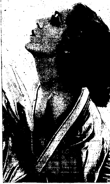
Mary Pickford, "America's Sweetheart" of yesteryears, today was selected to become the wife of Buddy Rogers, actor and orchestra leader in a ceremony in California. The marriage is Rogers' first, Miss Pickford's third. The bride is 44 years old, the groom 32.