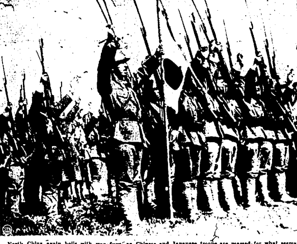
North China again boils with war-fury, as Chinese and Japanese troops are massed for what seems inevitable battle in the Peiping area. Shown above is an enthusiastic Japanese army detachment in field uniform.