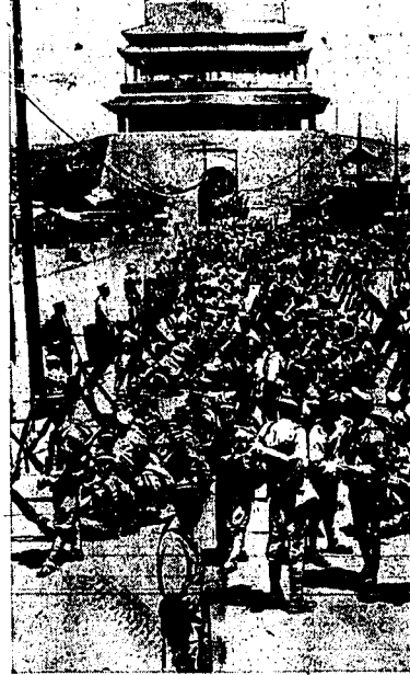
A scene of bitter warfare replaces the leisurely military spectacle pictured outside the gates of Peiping, where Japan has hurled the full force of its north China army in an effort to establish its dominance as a commercial exploitation.